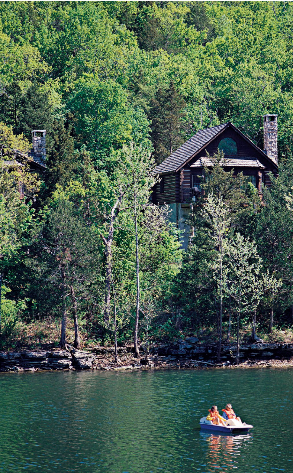
7 Branson/Lake of the Ozarks/ Hot Springs/Oklahoma